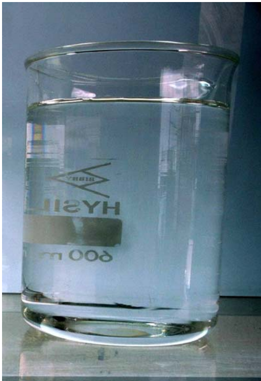
Treated Water To Drinking Water Standard