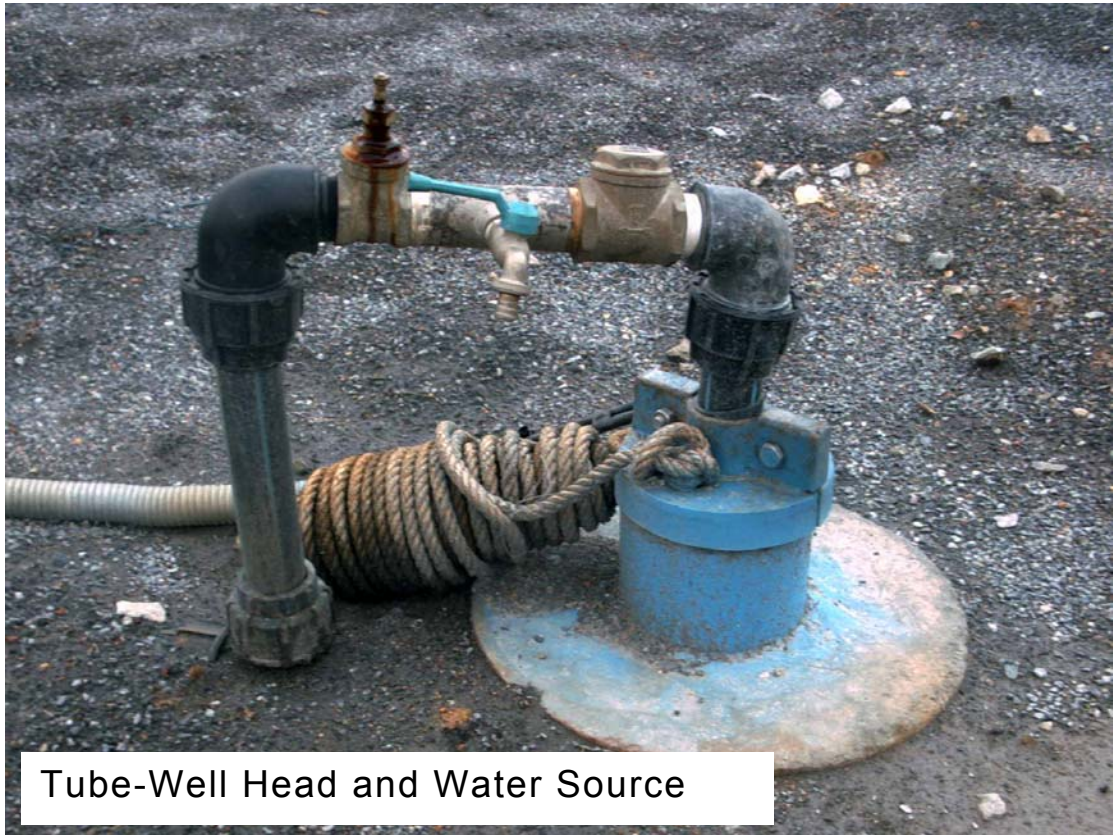
Tube-Well Head and Water Source