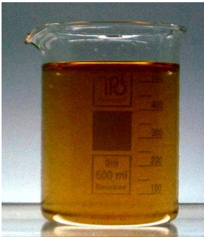
Tube-Well Water Quality